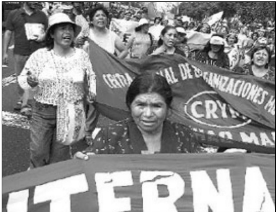
The picture shows one of the marches in Peru commemorating International Women's Day

This report is only a snapshot of the themes with regard to gender relations and women's situation in Peru that need attention